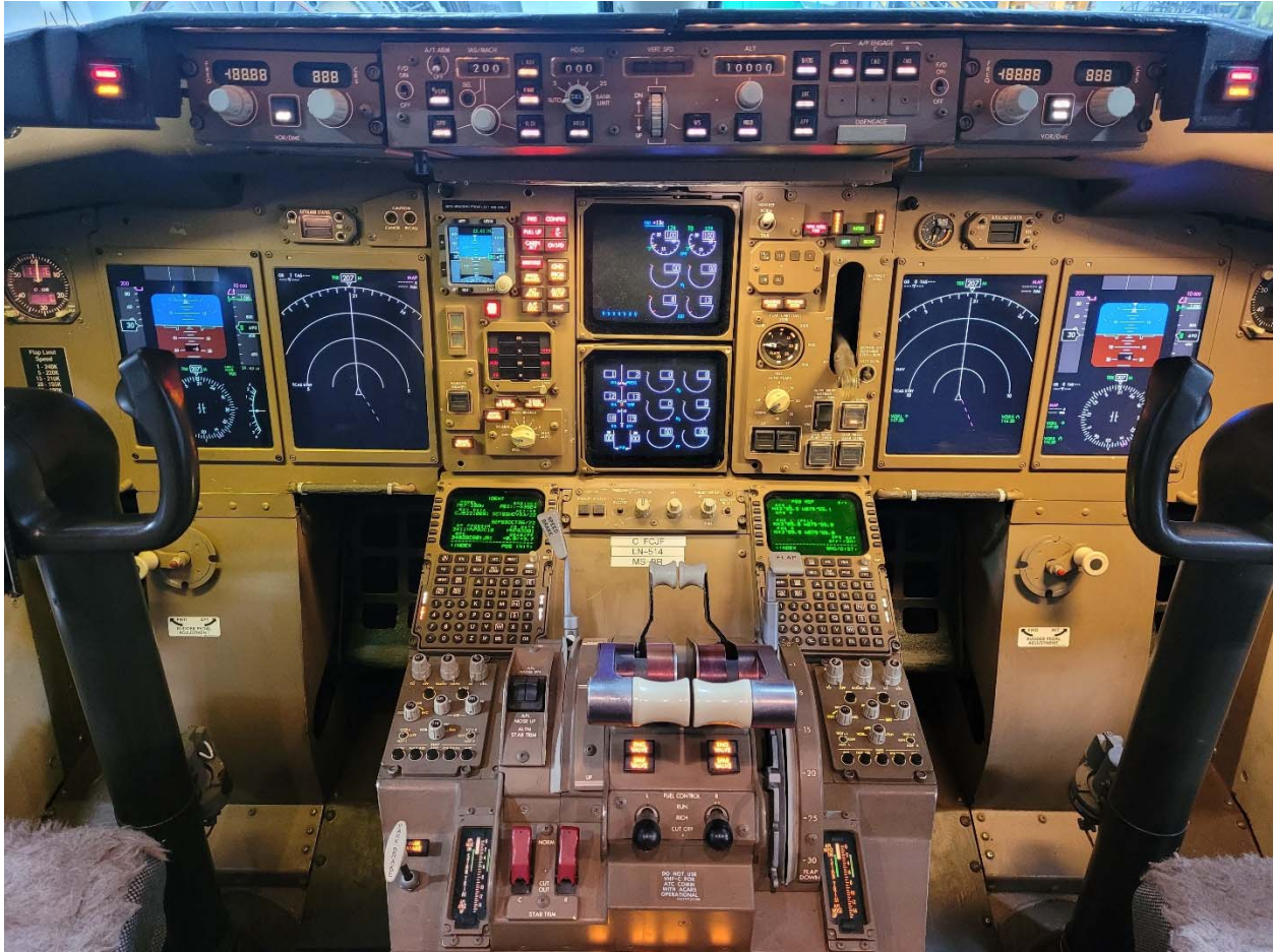
Photo representation of expected layout after Conversion